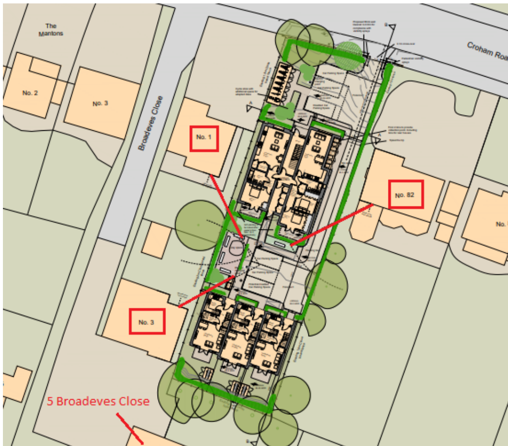
Proposed site plan showing relationship with neighbouring properties (45 degree lines marked in red)