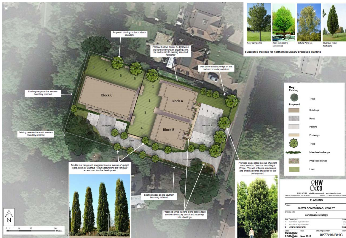
Figure 1: Indicative Landscaping Strategy submitted for 19/04441/OUT

3.3 The above figure is taken from the Outline permission to show the indicative siting of the hard and soft landscaping. This provides an indication of where the lawn, trees and hardstanding would be situated with the reserved matter condition to seek full details.