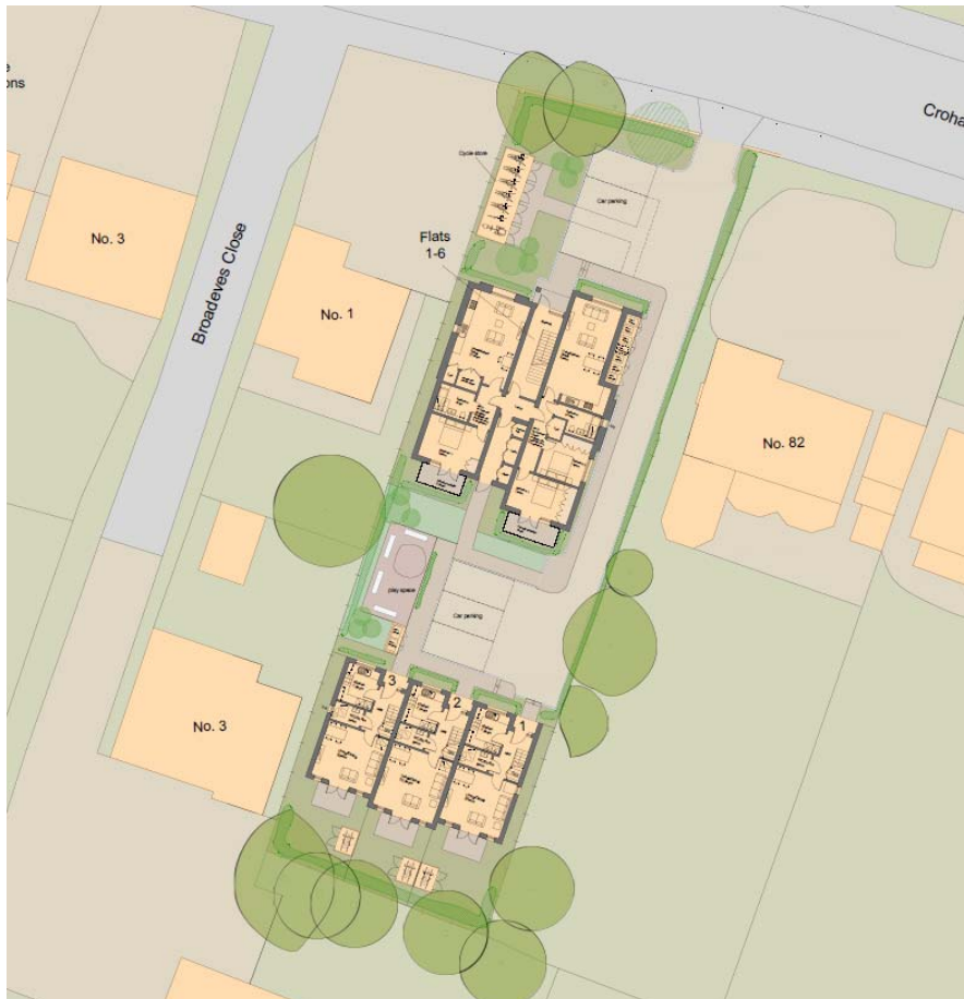
Proposed site plan showing positioning and footprint of buildings

8.11 The separation distance between the front block and the rear houses is 14m. At the front, the separation distance from the flank elevation of the block and the site boundary to the west is 1m, and the distance between the buildings is 4m. On the east side, the gap is larger to accommodate the access road; 3.5m to the site boundary and 6m to the adjacent building. The gaps are the same as the existing arrangement and maintain adequate separation between properties when viewed from the street scene. At the rear, there is a 1m gap on either side between the flank walls of the houses and the site boundary. The existing 1.8m high (on the east) or 2m high (on the west) close board fences would be retained. Overall, the positioning of the buildings is acceptable.