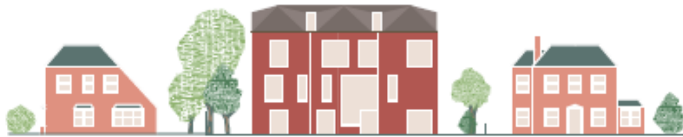
Figure 2.10c: Where surrounding buildings are predominantly detached dwellings of two (2) or more storeys, new developments may be three (3) storeys with an additional floor contained within the roof space or set back from the building envelope below.

streetscene. It does not breach the 45 degree lines from neighbouring properties in elevation which indicates that the height and massing is appropriate.